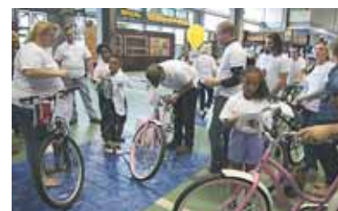
Rosedale Tech's Build-a-Bike teams distributing their bikes to the kids