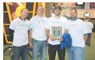
Team Techies showing off their first place trophy at the Build-a-Bike event